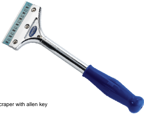
Scraper with allen key