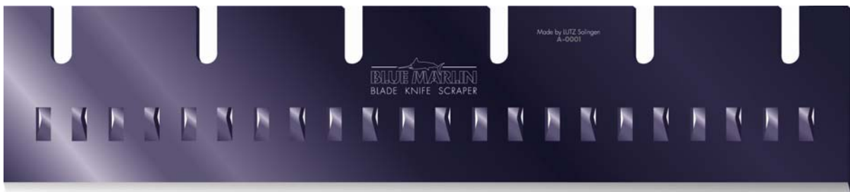
Stripper blade 35 cm