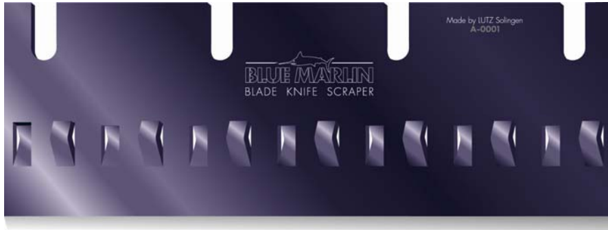
Stripper blade 21 cm