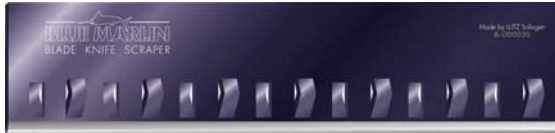
Scraper blade 10 cm