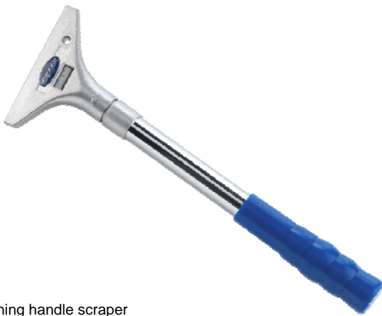
Turning handle scraper

Innovation was also built into the design of the packaging as Profloor Technology was the first company to launch the elegant aluminium blade holder in 2006. In the meantime, this idea has almost become the industry standard and has found many imitators in the sector. The standard scraper blades, which come in the width of 10cm, are obtainable in the original, high-gloss, blue tins with the Blue Marlin logo embossed on the lid.